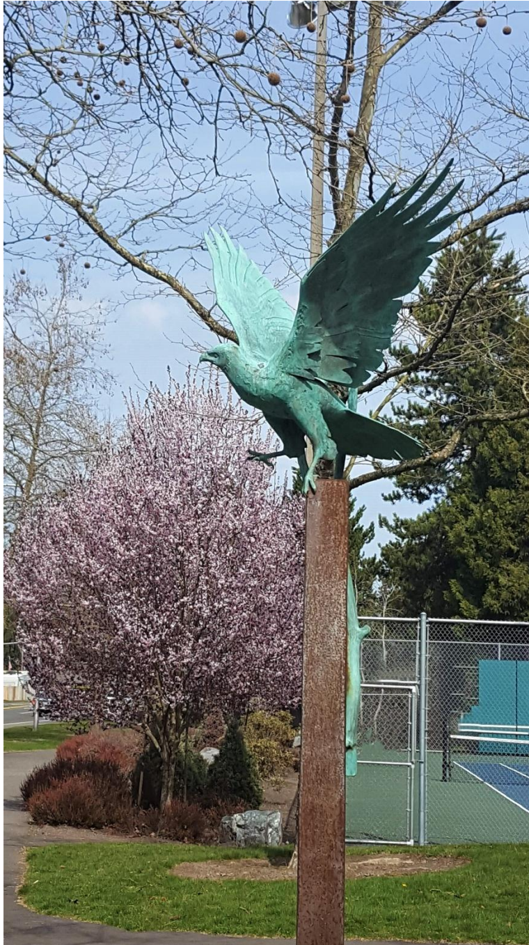
Hawk by Steve Tyree installed at Game Farm park in 2019 (above)

Photographs of artwork proposed for deaccession: