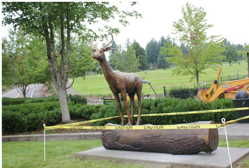
The Long Look by Brad Rude after being installed at Centennial Viewpoint Park in 2013 (above)

Photographs of artwork proposed for deaccession: