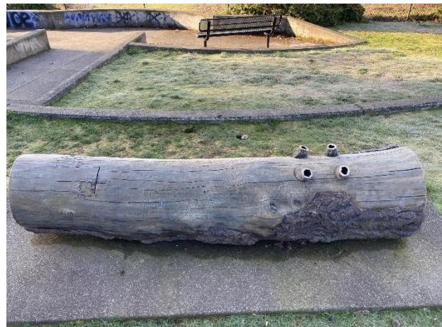
The Long Look by Brad Rude theft and damages in 2024 (above)